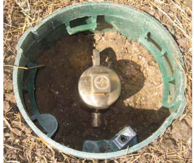
Chem-Rod grounding electrode installed in service well.

An efficient grounding system is critical to personnel safety and uninterrupted operations. But conventional ground rods are typically insufficient for industrial uses where target resistance can be less than 1 ohm.